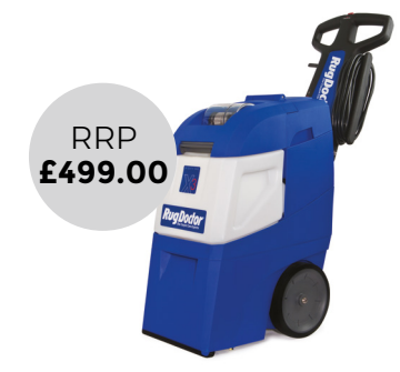
Portable Spot Cleaner