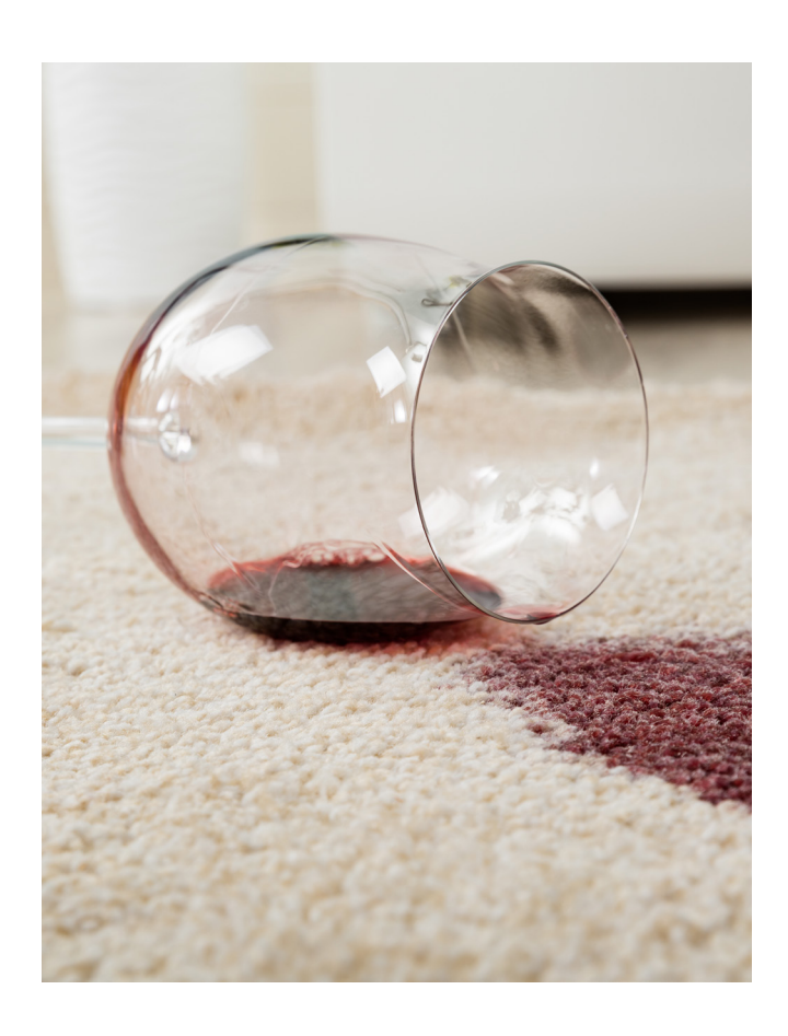
Rug Doctor Oxy Power Stain Remover provides the power of bleach, without any of the nasty side effects.