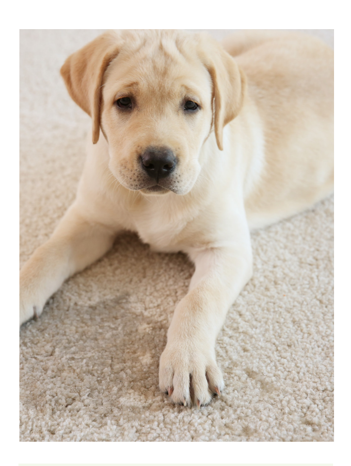
The Urine Eliminator is Perfect for pet owners and families with young children.